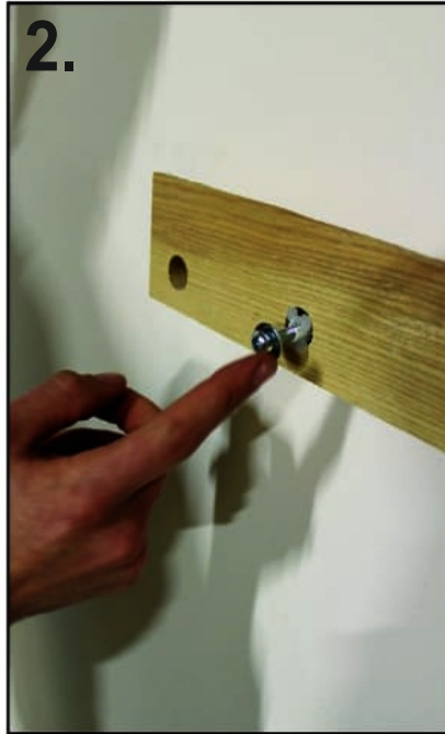
2. Thread the metal screw through the plastic washer until it threads till the wall