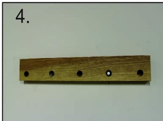
4. Fix all the screws firmly in the 5 slots provided