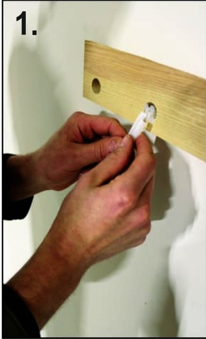
1. Insert the plastic dry wall anchor inside the hole drilled into the wall through the wooden support

ITEM DESCRIPTION : WALL MOUNTING BEDSIDE